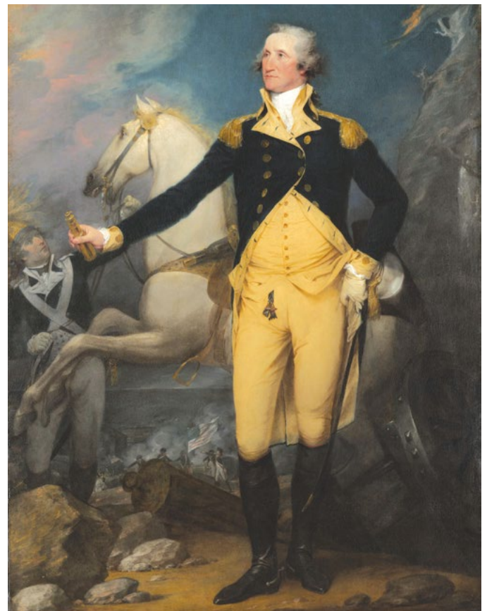
General George Washington at Trenton by artist John Trumbull (1756-1843), Yale University Art Gallery. This 1792 painting was among a collection of 100 works that Trumbull donated to Yale in 1831 in exchange for a $1,000 annuity.

The same conditions faced by John Trumbull are what drive interest in charitable gift annuities today: the desire for stable income that can't be outlived, and to do something useful and philanthropic with accumulated assets.